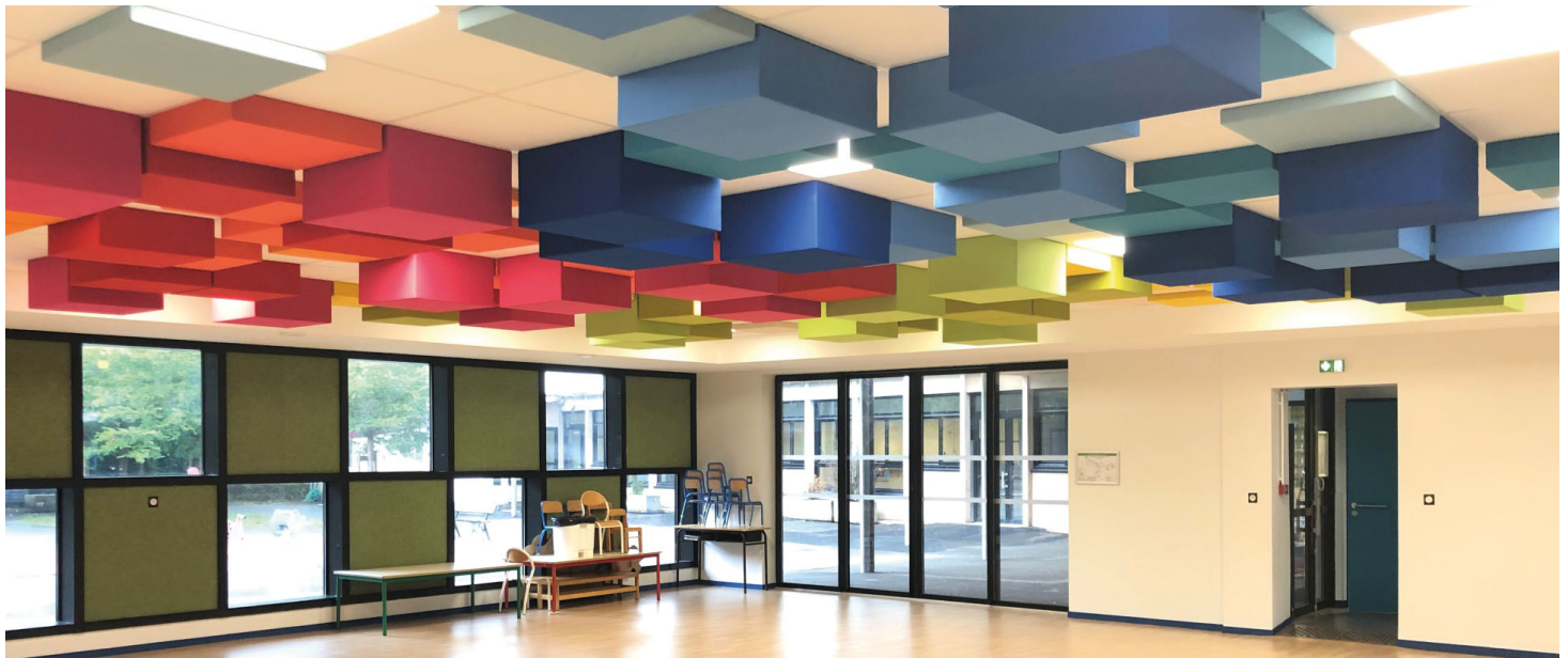
Design and installation: Architect : Despré / Contractor: Parent Plâtrerie